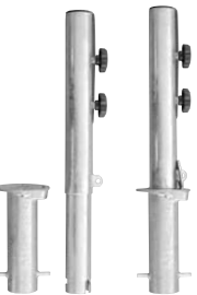
REMOVABLE IN-GROUND FITTING For installation in ground. Pipe fitting can be easily removed leaving behind only the flush ground fitting.