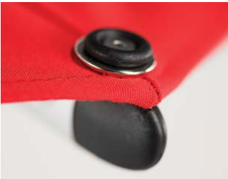
STAINLESS STEEL CANOPY FIXINGS

The Monaco umbrella features a 20 micron marine grade anodised aluminium mast and arms. The umbrella is opened and closed using a high quality rope and pin system that uses heavy duty stainless steel pulleys that are made for commercial use and coastal environments.