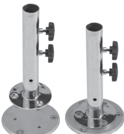
REMOVABLE SPIGOT SYSTEM For installation onto a wooden deck or concrete patio.

You can either use your umbrella with a freestanding base, or alternatively, you can install it using one of our removeable spigot or in-ground fitting systems. The base plate is bolted down to a timber deck or a concrete patio and the removable spigot is then fixed to the base plate. You can also install two or more installation fittings to give you multiple umbrella locations for different seasons or events.