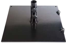
34KG COMMERCIAL STEEL BASE Steel base with wheels and 50mm spigot