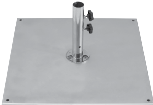
35KG OR 45KG GALVANISED STEEL PREMIUM BASE