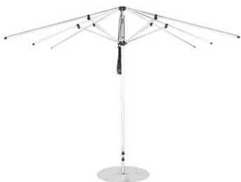
ANODISED ALUMINIUM FRAME