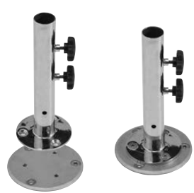
REMOVABLE SPIGOT SYSTEM For installation onto a wooden deck or concrete patio.