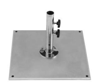
35KG GALVANISED STEEL PREMIUM BASE