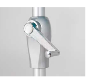
EASY TO USE WINDER SYSTEM