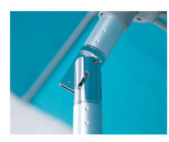
STRONG 60 DEGREE TILTING MECHANISM

The Venice Tilt umbrella is cleverly designed and engineered to be durable, long lasting and easy to operate. Because of the fibreglass arms the umbrella is extremely durable and is able to withstand very high wind and tough conditions. The anodised aluminium post is very strong and able to be split in the middle to reduce the length for storage. The other benefit of the umbrella is that while it is one of the strongest outdoor umbrellas on the market, it is also one of the lightest umbrellas. This makes it easy to carry if it needs to be moved or stored.